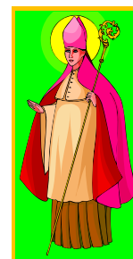
St. Stanislaus of Krakow