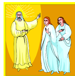
Jesus with Disciples on the way to Emmaus