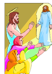
Raising of Lazarus