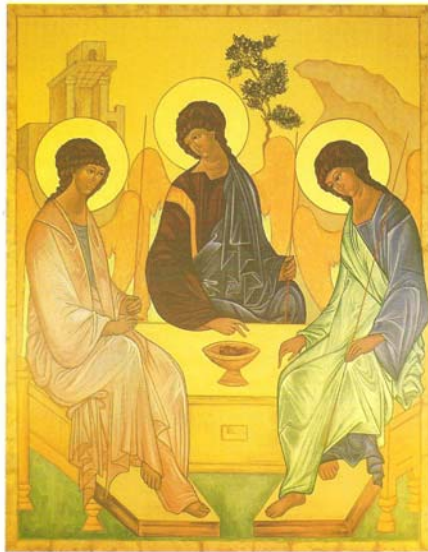
Old Testament image of the Holy Trinity