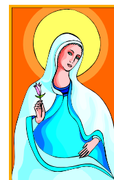
St. Helena of Poland

RECTORY DOORS: The work to replace the exterior doors on the Rectory will begin on Wednesday August 20th & will take about a week to complete. The new doors will replace the front, side, & kitchen doors, replacing of the storm doors, repair of the transom over the front door & repairs to the office door. The work is being done by Jay Angle Co. Once the work is done you are welcome to come & see what has been done. The work is being funded by the Y.M.S. of R. from Bingo proceeds & a donation from the Society of Friends.