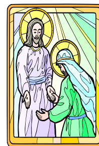
Jesus & Doubting Thomas