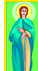
St. James the Greater

8AM Mass for the intentions of our parishioners.