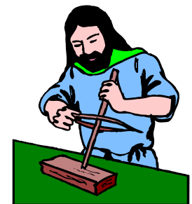
St. Joseph, Patron Saint of fathers