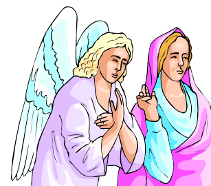
Annunciation of Our Lord