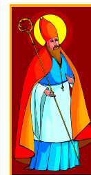
St. Augustine of Canterbury