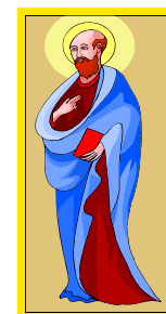
S.S. SIMON & JUDE